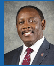
ORANGE COUNTY MAYOR JERRY L. DEMINGS