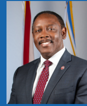
ORANGE COUNTY MAYOR JERRY L. DEMINGS